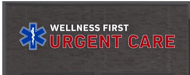
SIMULATED NIGHT VIEW